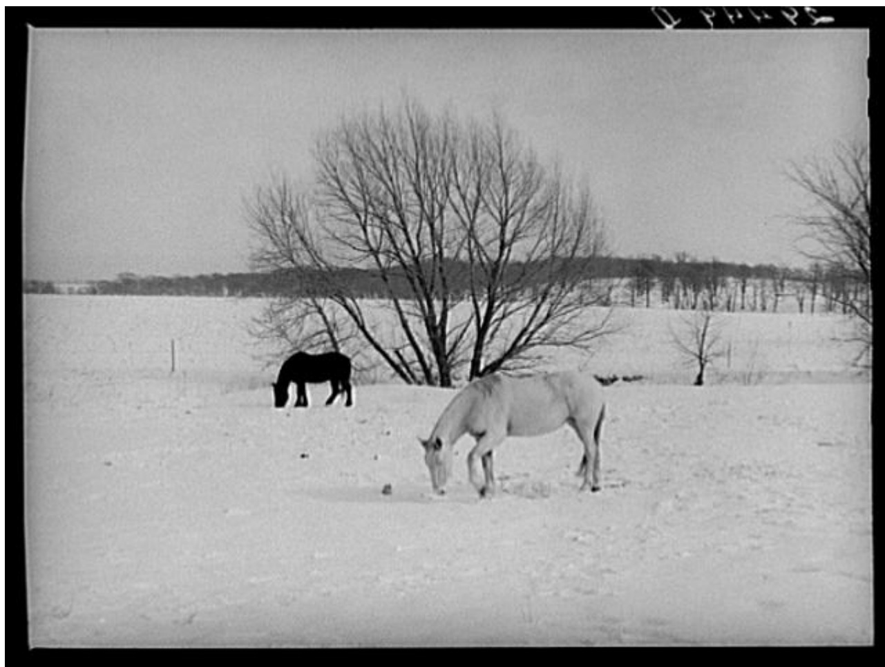
Horses in Snow in Marshall County, Iowa, 1940, by U.S. Farm