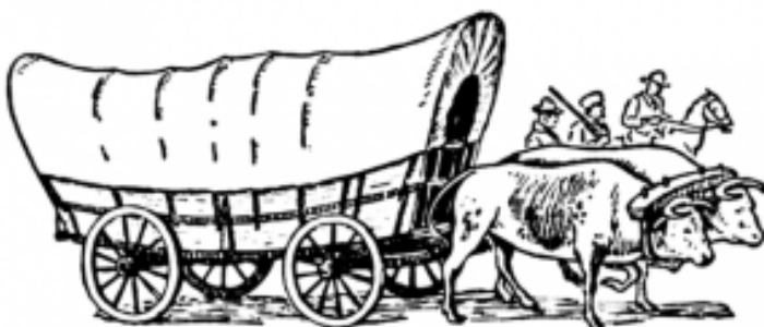
Covered wagon pulled by oxen.