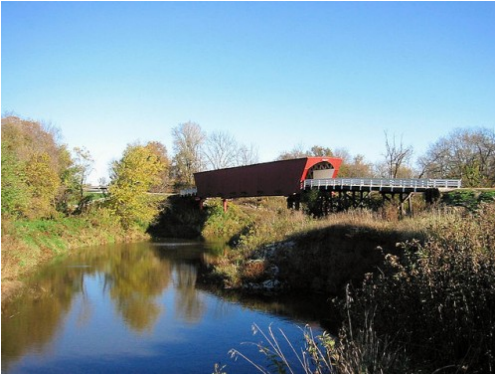
Roseman Covered Bridge, Madison County, Iowa.